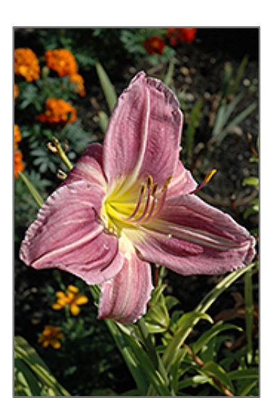
Prairie Blue Eyes Daylily flowers

A beautiful midseason bloomer that features large lavender flowers with chartreuse throats and hints of blue around the eyezone; heat and drought tolerant, excellent for accenting borders, beds and containers; a perfect choice for any level of gardener