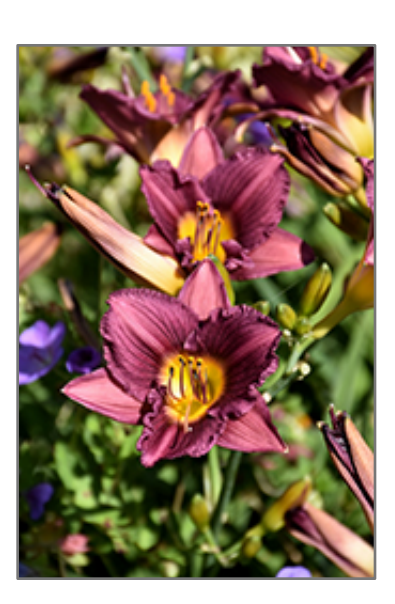
Purple de Oro Daylily flowers

A compact, vigorous and long blooming selection that features ruffled, plum colored flower with bright golden yellow throats; strong, sturdy stems rise above mounds of arching green foliage; an easy to grow variety perfect for beds, borders and containers