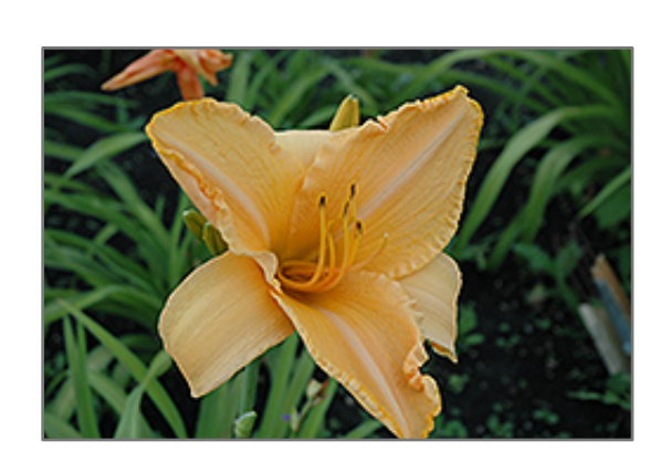
Ruffled Apricot Daylily flowers

Eye-catching large, fragrant, ruffled apricot trumpets with creamy-pink midribs; strong, sturdy stems rise above arching green foliage; long blooming season, making an appearance in early summer and then reblooming; great for borders and beds