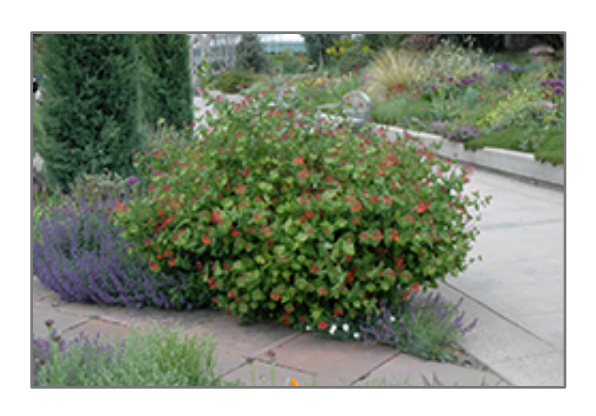
Dropmore Scarlet Trumpet Honeysuckle in bloom

This woody vine will require occasional maintenance and upkeep, and is best pruned in late winter once the threat of extreme cold has passed. It is a good choice for attracting butterflies and hummingbirds to your yard. It has no significant negative characteristics.