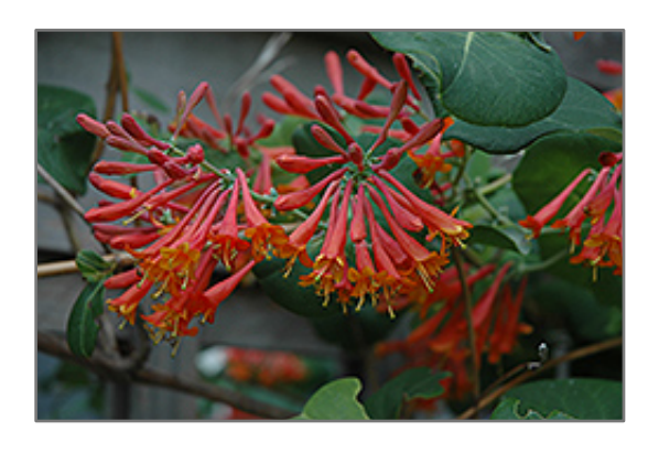
Dropmore Scarlet Trumpet Honeysuckle flowers

Dropmore Scarlet Trumpet Honeysuckle is a multi-stemmed deciduous woody vine with a twining and trailing habit of growth. Its relatively coarse texture can be used to stand it apart from other landscape plants with finer foliage.