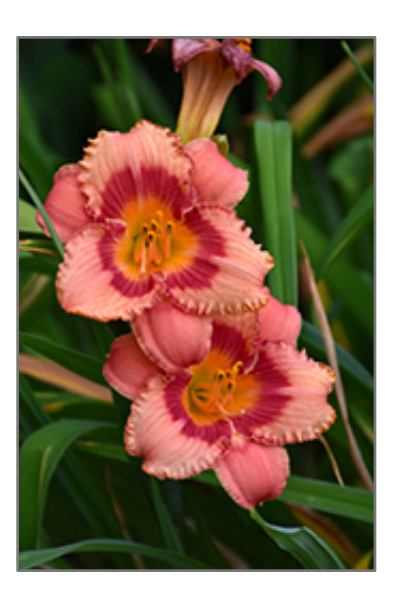
Strawberry Candy Daylily flowers

A long blooming selection that features bright coral pink flowers with cherry red ruffled edges and eyezones; reblooming habit, a great way to add color to borders and beds throughout the summer months