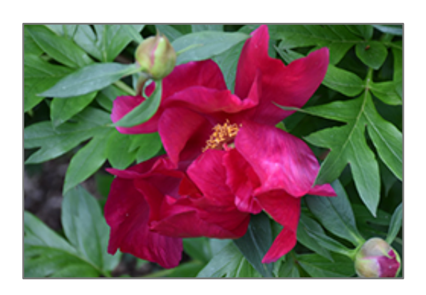
Scarlet Heaven Itoh Peony flowers

This captivating peony will create a dramatic late spring display in garden and border plantings; the buds open to reveal stunning scarlet blooms with gold center anthers; the fragrant flowers open on stiff stems making them an excellent cut flower