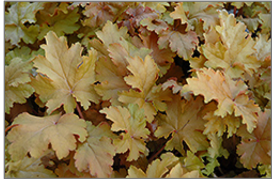
Amber Waves Coral Bells foliage

Amber Waves Coral Bells is a fine choice for the garden, but it is also a good selection for planting in outdoor pots and containers. It is often used as a 'filler' in the 'spiller-thriller-filler' container combination, providing a mass of flowers and foliage against which the larger thriller plants stand out. Note that when growing plants in outdoor containers and baskets, they may require more frequent waterings than they would in the yard or garden. Be aware that in our climate, most plants cannot be expected to survive the winter if left in containers outdoors, and this plant is no exception. Contact our experts for more information on how to protect it over the winter months.