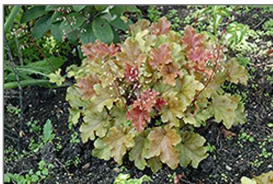
Amber Waves Coral Bells in bloom