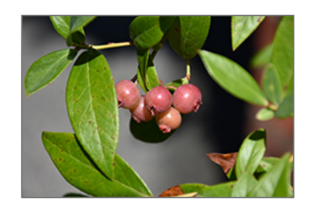
Pink Lemonade Blueberry fruit

Pink Lemonade Blueberry features dainty clusters of white bell-shaped flowers with shell pink overtones hanging below the branches from early to mid spring. It has green deciduous foliage. The glossy oval leaves turn outstanding shades of gold and in the fall. It features an abundance of magnificent rose berries from early to mid summer.