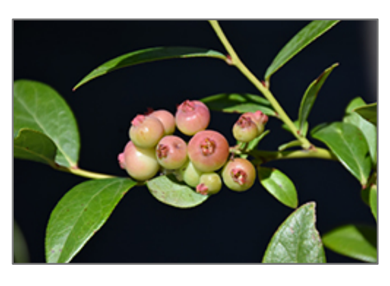
Pink Lemonade Blueberry fruit