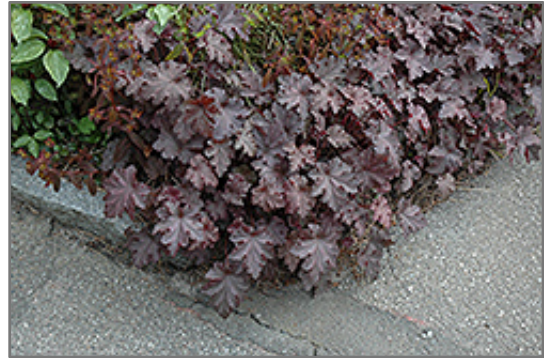
Stormy Seas Coral Bells

Stormy Seas Coral Bells is recommended for the following landscape applications;