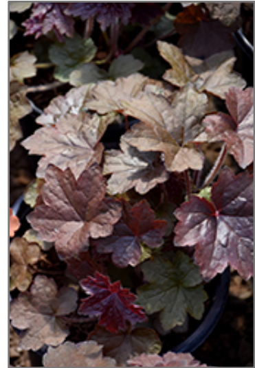
Palace Purple Coral Bells foliage

Palace Purple Coral Bells is recommended for the following landscape applications;