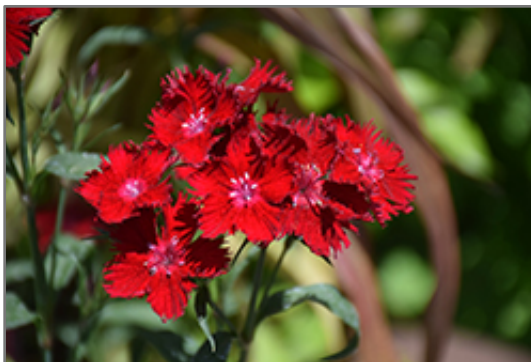
Rockin' Red Pinks flowers

Rockin' Red Pinks is an herbaceous evergreen perennial with a mounded form. It brings an extremely fine and delicate texture to the garden composition and should be used to full effect.