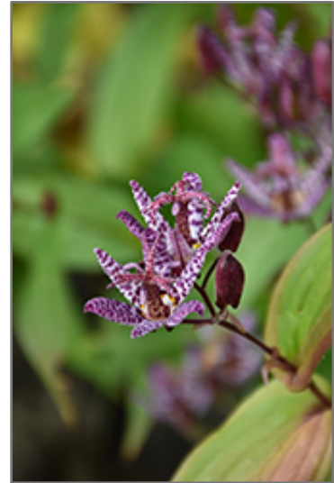
Toad Lily flowers