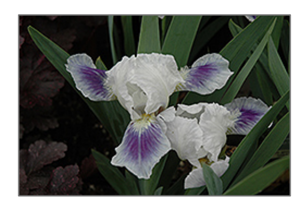
Boo Iris flowers