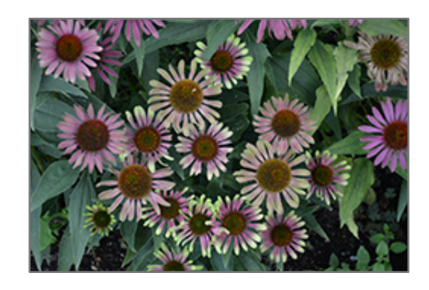
Green Twister Coneflower flowers

Green Twister Coneflower is an herbaceous perennial with an upright spreading habit of growth. Its medium texture blends into the garden, but can always be balanced by a couple of finer or coarser plants for an effective composition.