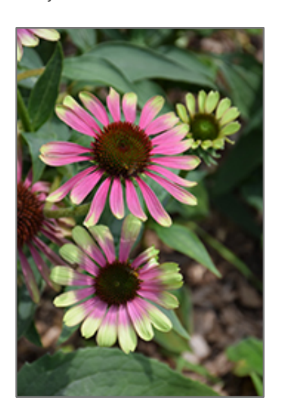
Green Twister Coneflower flowers

This is a relatively low maintenance plant, and is best cleaned up in early spring before it resumes active growth for the season. It is a good choice for attracting birds and butterflies to your yard, but is not particularly attractive to deer who tend to leave it alone in favor of tastier treats. It has no significant negative characteristics.