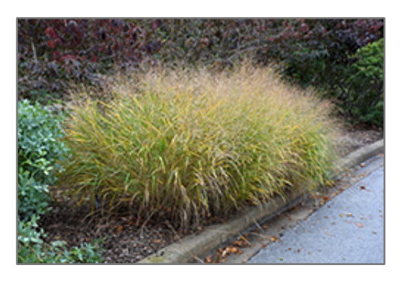
Red Switch Grass in fall