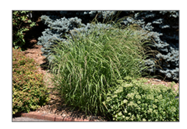
Red Switch Grass

Red Switch Grass features airy plumes of red flowers with pink overtones rising above the foliage from mid to late summer. Its attractive grassy leaves are grayish green in colour with showy dark red variegation. As an added bonus, the foliage turns gorgeous shades of burgundy and in the fall. The dark red seed heads are carried on showy plumes displayed in abundance from early fall to mid winter. The tan stems can be quite attractive.