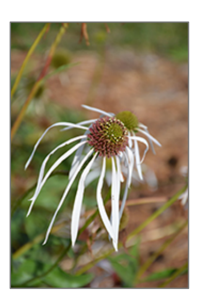
Hula Dancer Coneflower flowers

This variety features long, narrow, drooping white petals with hints of pink and coppery-orange center cones; stems and seed heads will remain erect and feed the birds in winter; use in naturalized areas