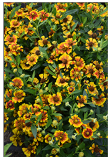
Salud Embers Sneezeweed flowers