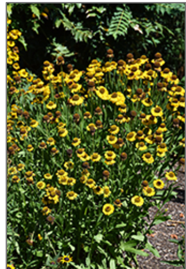
Salud Golden Sneezeweed in bloom