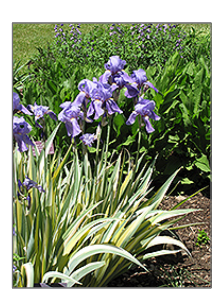
Golden Variegated Sweet Iris in bloom