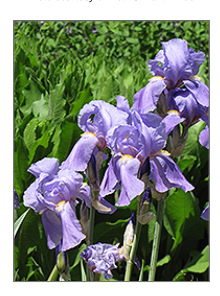
Golden Variegated Sweet Iris flowers