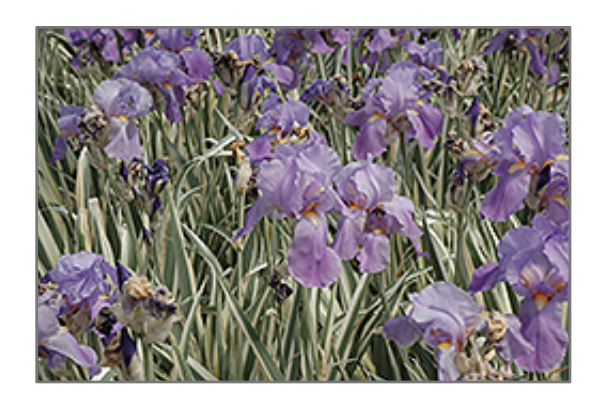
Variegated Sweet Iris flowers

Variegated Sweet Iris is an herbaceous perennial with an upright spreading habit of growth. Its medium texture blends into the garden, but can always be balanced by a couple of finer or coarser plants for an effective composition.