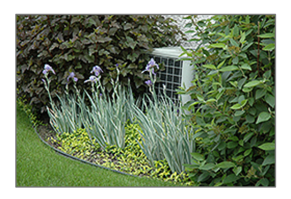
Variegated Sweet Iris

This plant will require occasional maintenance and upkeep, and should be cut back in late fall in preparation for winter. Deer don't particularly care for this plant and will usually leave it alone in favor of tastier treats. Gardeners should be aware of the following characteristic(s) that may warrant special consideration;