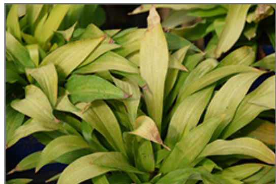
Munchkin Fire Hosta foliage