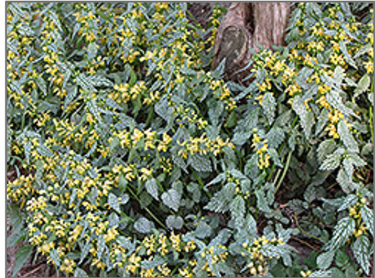
Hermann's Pride Yellow Archangel in bloom

This plant does best in partial shade to shade. It is an amazingly adaptable plant, tolerating both dry conditions and even some standing water. It is considered to be drought-tolerant, and thus makes an ideal choice for a low-water garden or xeriscape application. It is not particular as to soil type or pH. It is highly tolerant of urban pollution and will even thrive in inner city environments. This is a selected variety of a species not originally from North America. It can be propagated by division; however, as a cultivated variety, be aware that it may be subject to certain restrictions or prohibitions on propagation.