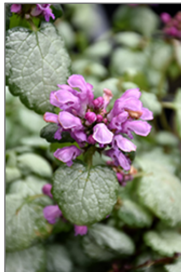
Red Nancy Spotted Dead Nettle flowers