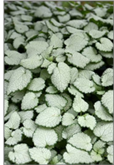
Red Nancy Spotted Dead Nettle foliage

Red Nancy Spotted Dead Nettle is a fine choice for the garden, but it is also a good selection for planting in outdoor pots and containers. Because of its spreading habit of growth, it is ideally suited for use as a 'spiller' in the 'spiller-thriller-filler' container combination; plant it near the edges where it can spill gracefully over the pot. Note that when growing plants in outdoor containers and baskets, they may require more frequent waterings than they would in the yard or garden. Be aware that in our climate, most plants cannot be expected to survive the winter if left in containers outdoors, and this plant is no exception. Contact our experts for more information on how to protect it over the winter months.