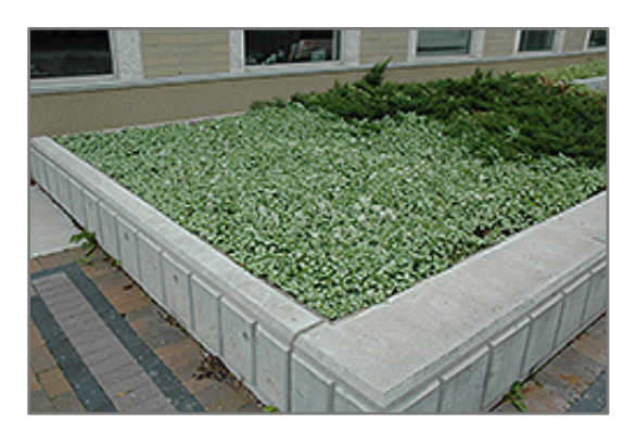
White Nancy Spotted Dead Nettle in bloom