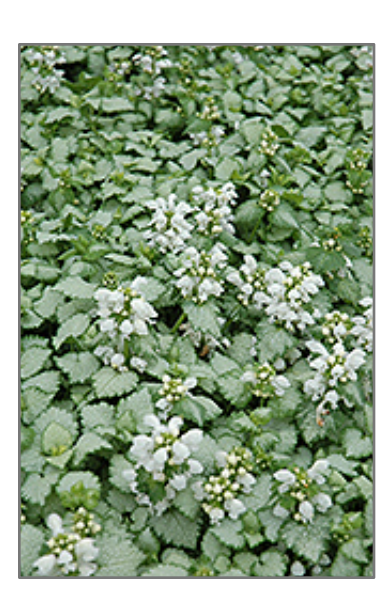
White Nancy Spotted Dead Nettle flowers