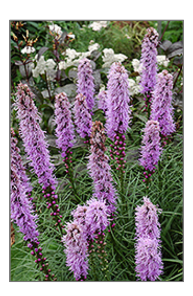
Kobold Blazing Star flowers