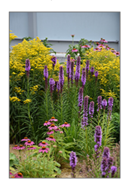
Kobold Blazing Star in bloom