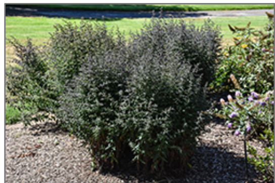
Prince Calico Aster