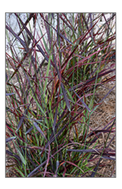
Hot Rod Switch Grass foliage