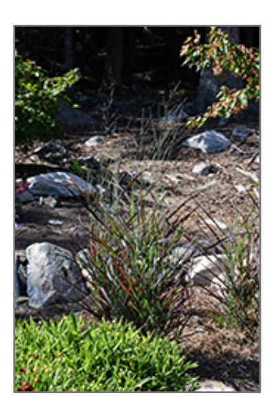
Hot Rod Switch Grass