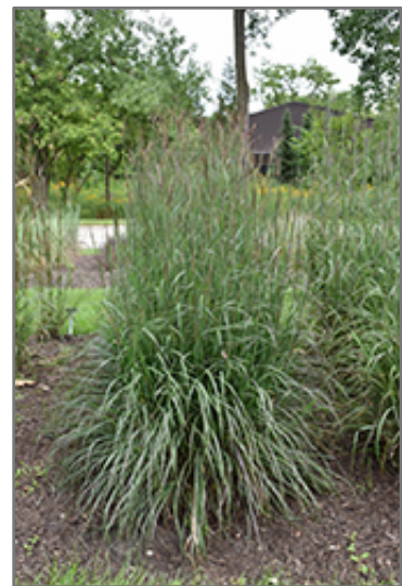
Blackhawks Bluestem in bloom