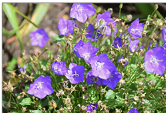
Violet Teacups Bellflower flowers