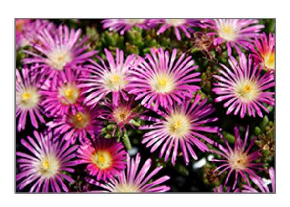
Delmara Pink Ice Plant flowers

A low growing carpet-like, succulent, native to South Africa but amazingly hardy in North America; dazzling hot pink, daisy-like flowers with butter centers; perfect for xeriscapes, rock gardens, screes and sandy soils