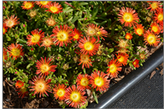
Delmara Red Ice Plant flowers

Delmara Red Ice Plant will grow to be only 4 inches tall at maturity extending to 6 inches tall with the flowers, with a spread of 15 inches. When grown in masses or used as a bedding plant, individual plants should be spaced approximately 12 inches apart. Its foliage tends to remain low and dense right to the ground. It grows at a fast rate, and under ideal conditions can be expected to live for approximately 5 years. As an evergreen perennial, this plant will typically keep its form and foliage year-round.