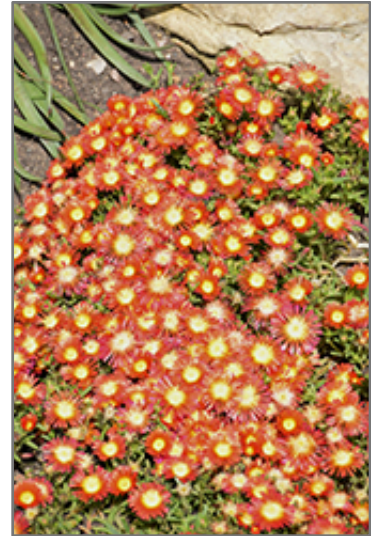
Delmara Red Ice Plant

This is a relatively low maintenance plant, and is best cleaned up in early spring before it resumes active growth for the season. It is a good choice for attracting bees and butterflies to your yard. It has no significant negative characteristics.