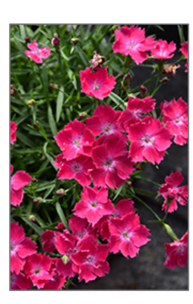
Beauties Kahori Scarlet Pinks flowers

Vivid scarlet flowers with white centers, covering mounds of fine foliage; great for flower arrangements; reblooms; pair up with summer blooming perennials and annuals to time a continued flower display