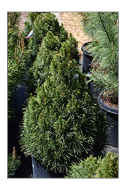
Green Penguin Scotch Pine