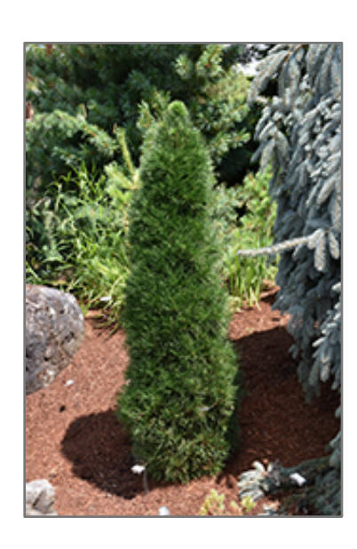
Green Penguin Scotch Pine