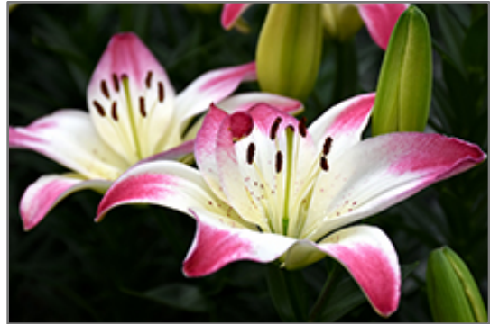
Lollypop Lily flowers