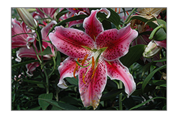
Stargazer Lily flowers