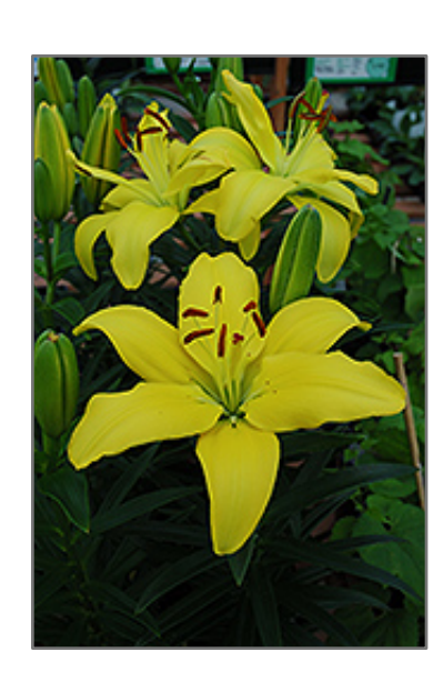
Yellow Pixie Lily flowers

Yellow Pixie Lily features bold yellow trumpet-shaped flowers with brown anthers at the ends of the stems in early summer. The flowers are excellent for cutting. Its narrow leaves remain green in colour throughout the season.