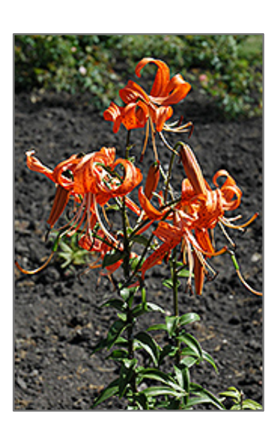
Tiger Lily flowers

Tiger Lily features bold nodding orange trumpet-shaped flowers with black spots at the ends of the stems in mid summer. The flowers are excellent for cutting. Its narrow leaves remain green in colour throughout the season.