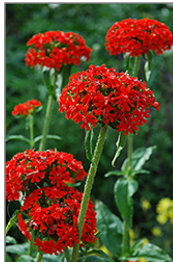
Maltese Cross flowers