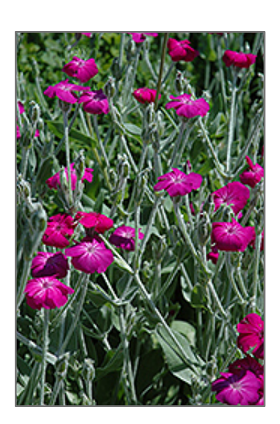
Rose Campion flowers

Rose Campion has masses of beautiful fuchsia flowers with white eyes at the ends of the stems from early to mid summer, which are most effective when planted in groupings. The flowers are excellent for cutting. Its attractive tomentose pointy leaves remain gray in colour throughout the season. The silver stems can be quite attractive.