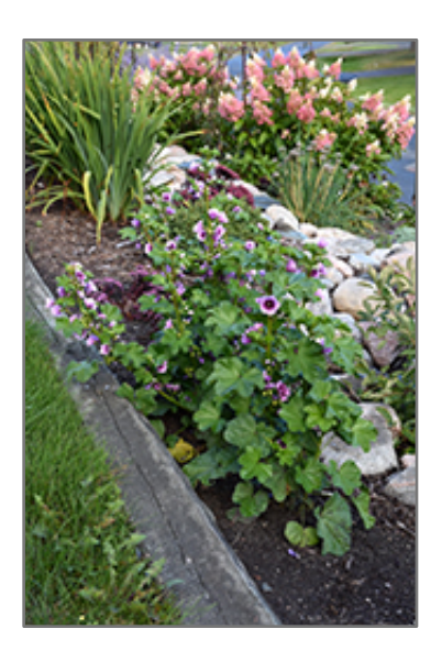
Zebrina Mallow in bloom

This plant should only be grown in full sunlight. It does best in average to evenly moist conditions, but will not tolerate standing water. It is not particular as to soil type or pH. It is highly tolerant of urban pollution and will even thrive in inner city environments. Consider applying a thick mulch around the root zone in winter to protect it in exposed locations or colder microclimates. This is a selected variety of a species not originally from North America.