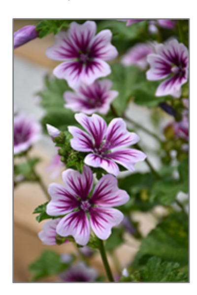
Zebrina Mallow flowers