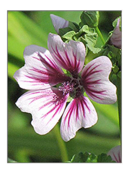
Zebrina Mallow flowers