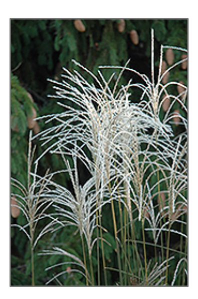
Graziella Maiden Grass fruit

Graziella Maiden Grass features dainty plumes of silver flowers rising above the foliage in late summer. The silver seed heads are carried on showy plumes displayed in abundance from early fall to late winter. Its grassy leaves are green in colour. The foliage often turns tan in fall. The tan stems can be quite attractive.