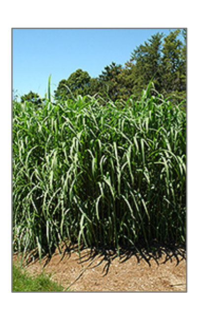
Giant Silver Grass

Giant Silver Grass will grow to be about 7 feet tall at maturity, with a spread of 4 feet. It tends to be leggy, with a typical clearance of 1 foot from the ground, and should be underplanted with lower-growing perennials. It grows at a medium rate, and under ideal conditions can be expected to live for approximately 20 years. As an herbaceous perennial, this plant will usually die back to the crown each winter, and will regrow from the base each spring. Be careful not to disturb the crown in late winter when it may not be readily seen!