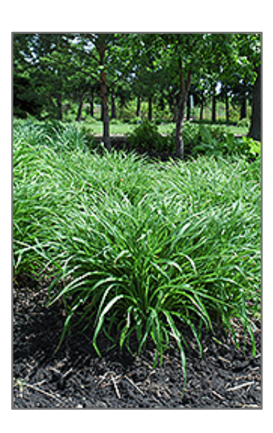
Moor Grass

Moor Grass is primarily grown for its highly ornamental fruit. The tan seed heads are carried on showy plumes displayed in abundance from early to late fall. It features dainty spikes of tan flowers rising above the foliage from mid to late summer. Its grassy leaves emerge chartreuse in spring, turning green in colour. As an added bonus, the foliage turns a gorgeous gold in the fall.