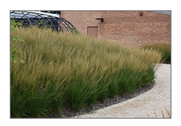
Moorflame Moor Grass