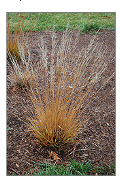
Moorflame Moor Grass in fall