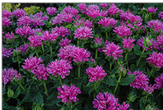
Petite Delight Beebalm flowers