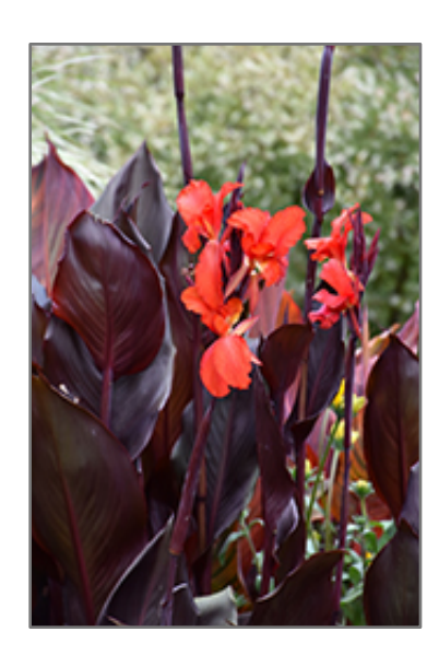
Red Futurity Canna flowers

This plant is native to the tropics and prefers growing in moist environments with evenly warm conditions all year round. In our climate, it is usually grown as an outdoor annual in the garden or in a container. If you want it to survive the winter, it can be brought in to the house and provided with special care, and then returned to the garden the following season. In its preferred tropical habitat, it can grow to be around 3 feet tall at maturity extending to 4 feet tall with the flowers, with a spread of 24 inches. However, when grown as an annual or when overwintered indoors, it can be expected to perform differently, and its exact height and spread will depend on many factors; you may wish to consult with our experts as to how it might perform in your specific application and growing conditions.