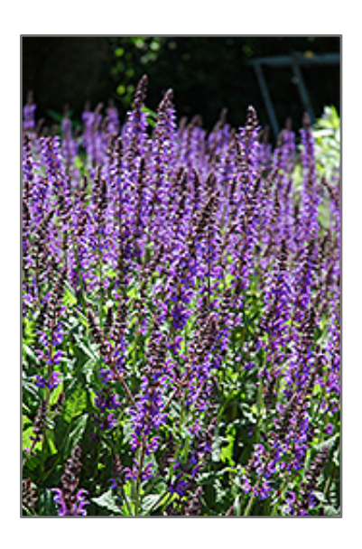
Showy Catmint flowers