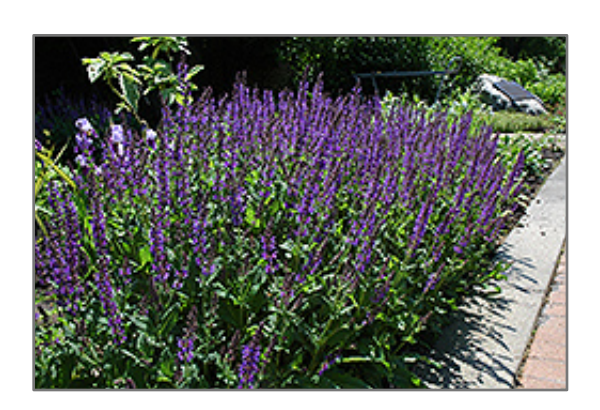
Showy Catmint in bloom