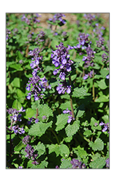
Dropmore Blue Catmint flowers