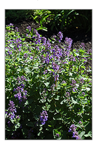
Dropmore Blue Catmint in bloom