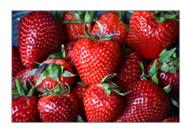
Albion Strawberry fruit

Sweeter than most strawberries because of its high sugar content; high yields of conical berries with firm texture and excellent flavor all season long; vigorous, and shows good disease resistance; tends to remain evergreen in frost free areas