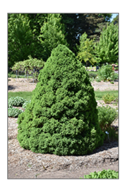
Dwarf Alberta Spruce

Dwarf Alberta Spruce is a dwarf conifer which is primarily valued in the landscape or garden for its distinctively pyramidal habit of growth. It has rich green evergreen foliage which emerges light green in spring. The needles remain green throughout the winter.